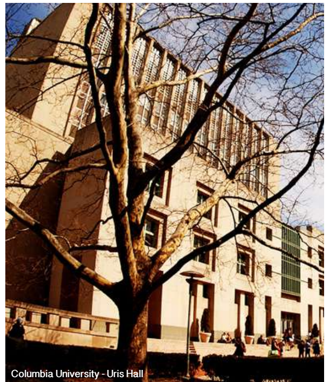
Columbia University - Uris Hall

Subway: The #1 subway train stops at the Columbia University station at West 116th Street and Broadway. This is a local train. Bus: Three bus lines (M4, M104 and M60) stop directly in front of the 116th Street gates. Cross-town buses connect with the #1 subway on Broadway or Seventh Avenue. NOTE: ID needed to enter the buildings.